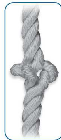
A hockled rope.

A braided or plaited rope, being torque-free, can have twist induced by constant working on winches and capstans. If a twist develops, it can easily be removed by "counter-rotating" when the rope is relaxed.