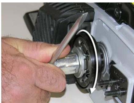
Rotate the clutch clockwise until you feel the piston hit the piston-stop.