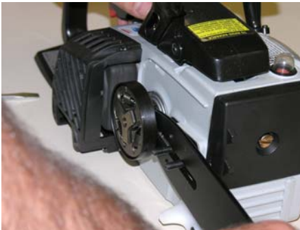
Remove standard bar & chain.