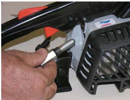
Install piston-stop into spark plug hole. Make sure threads are fully seated.