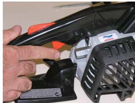
Finger-tight is all that is needed. Do not use piston stop with air wrench.