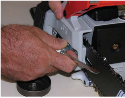
Remove bar nuts.