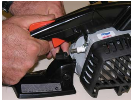
Remove spark plug wire