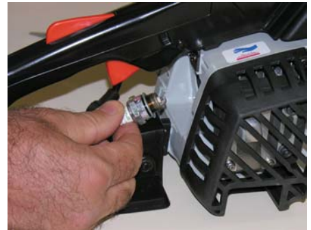
Remove spark plug