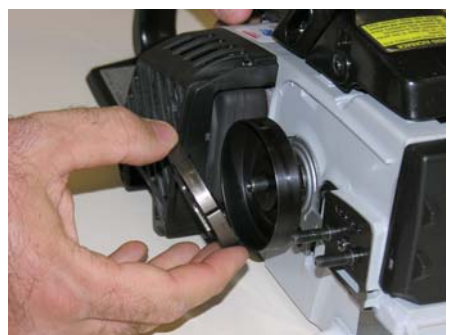
Remove the clutch. Take note of which side is facing the sprocket for later reinstallation.