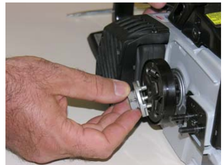
Seat clutch tool into clutch.