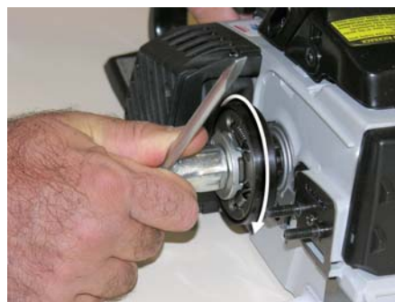
Using the bar wrench, turn the clutch tool clockwise to loosen the clutch.